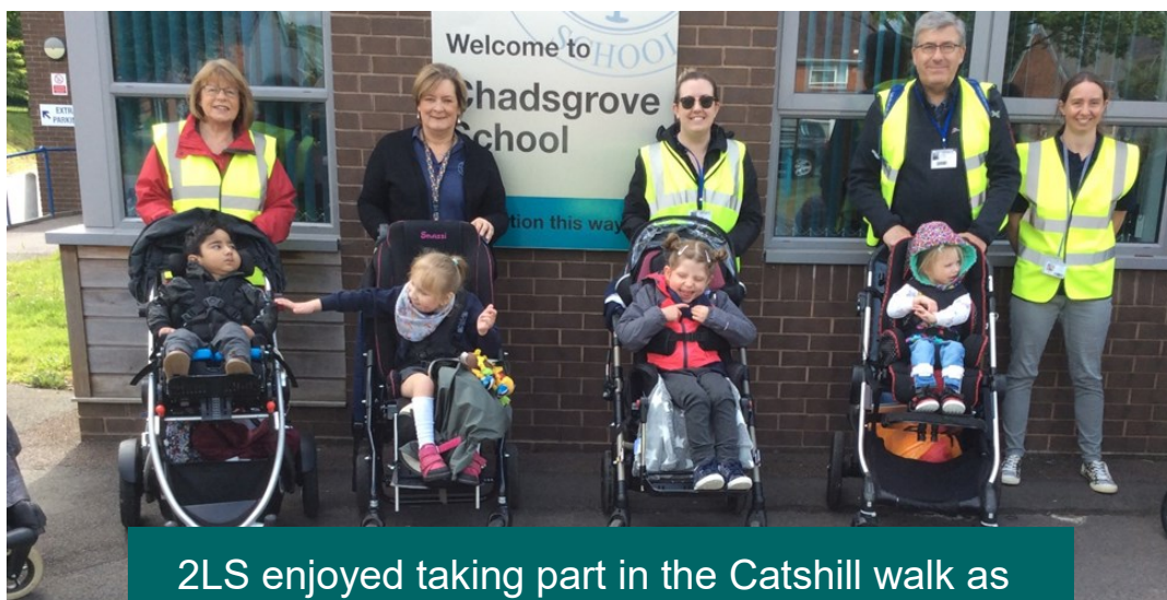
2LS enjoyed taking part in the Catshill walk as part of the Duke of Edinburgh Award