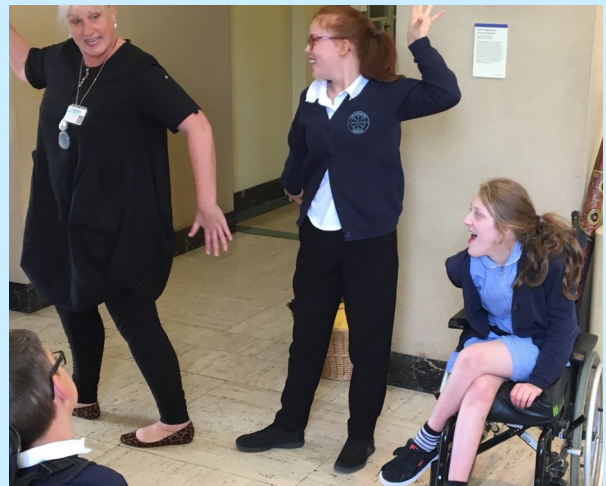
Walking like an Egyptian!